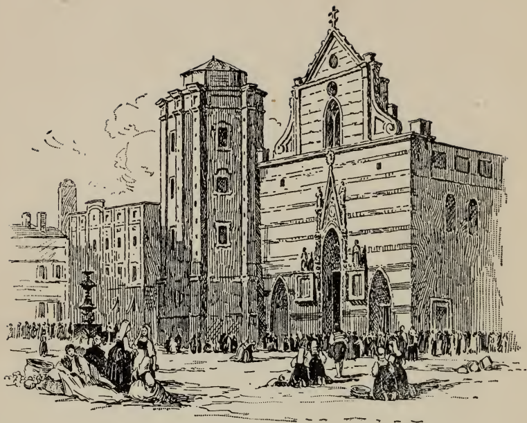
EXTERIOR OF CATHEDRAL, MESSINA